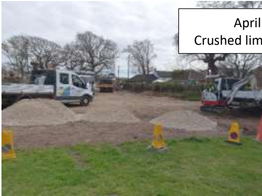
April 2022 Crushed limestone base