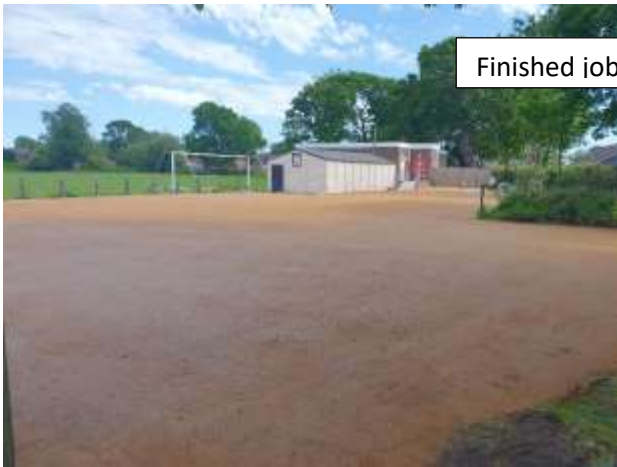
Finished job – May 2022