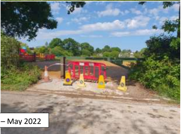
Finished job – May 2022