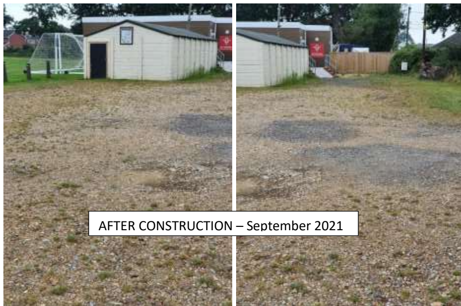
AFTER CONSTRUCTION – September 2021