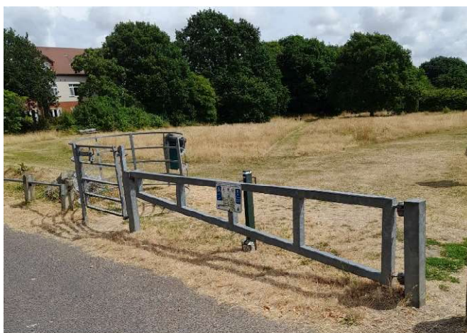
Example of kissing gate and low barrier gate without mesh infill.